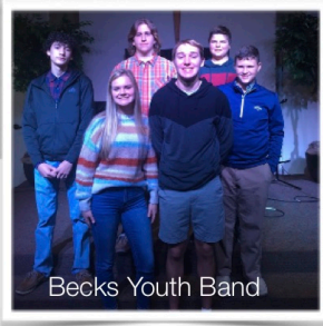
Becks Youth Band

Come out for an evening of music, mission, a meal and more!